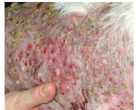
Figure 7: Severe generalised focal crusting and alopecia in a 10-year old neutered male Jack Russell Terrier with pemphigus foliaceus