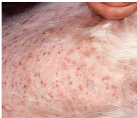
Figure 3: Papules, pustules and crusts on the ventrum of an 8-year old entire male Cavalier King Charles Spaniel with pemphigus foliaceus