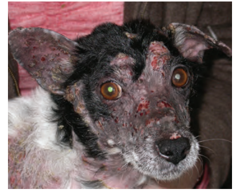
Figure 5: Severe crusting and alopecia on the head of a 10-year old neutered male Jack Russell Terrier with pemphigus foliaceus