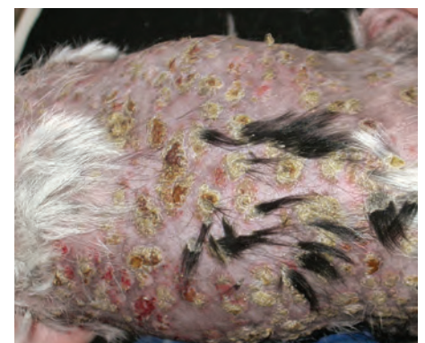
Figure 8: Severe focal crusting and alopecia of the ventral abdomen of a 10-year old neutered male Jack Russell Terrier with pemphigus foliaceus