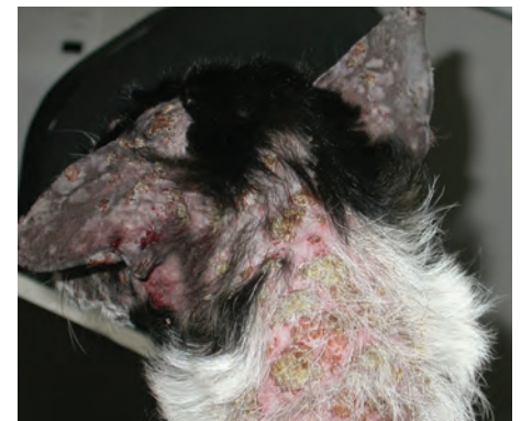
Figure 6: Severe focal crusting and alopecia on the ears and dorsal neck of a 10-year old neutered male Jack Russell terrier with pemphigus foliaceus