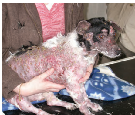
Figure 4: Severe generalised crusting and alopecia in a 10-year old neutered male Jack Russell Terrier with pemphigus foliaceus