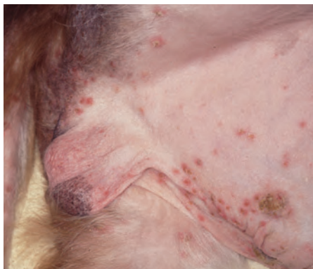
Figure 2: Papules, pustules and crusts on the ventral abdomen, legs, tail and perineal region of an 8-year old entire male Cavalier King Charles spaniel with pemphigus foliaceus